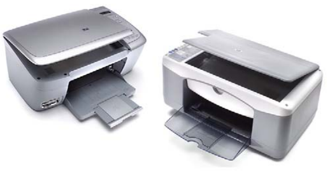
Hewlett-Packard all-in-one printers.

This being the case, Flextronics has had to implement RFID in its warehousing and shipping operations. (This is no doubt due in part to the mandates of Flextronics' OEM customers, who, in turn, have had to respond to the earlier mentioned RFID requirements of Walmart and other large retailers.) But a major difference between Flextronics and many other enterprises is that RFID plays a major role in the company's assembly processes. All printer housings include an RFID tag, manufactured by UPM Rafsec