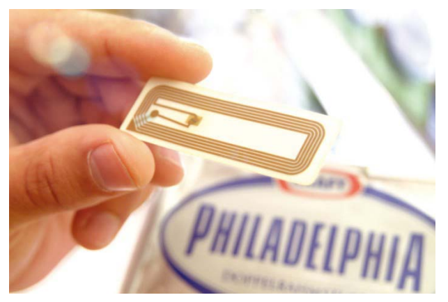
RFID tags are most commonly used to track consumer products.

In short, by implementing RFID— a complete system of transceivers and tags—one can achieve visibility to any asset within the RF range. This visibility creates all types of monitoring and data acquisition capabilities, and the gathered data can be aggregated and used in innumerable ways. But perhaps more intriguing is the possibility-if RFID systems are cleverly integrated with an organization's line of business equipment—for that equipment to act almost independently on the information it receives via RFID. Once again, however, this is all contingent upon the RFID system's ability to successfully integrate with the other hardware and software systems found in the environment in which the RFID system is deployed. In industrial automation environments, these systems include devices like programmable logic controllers (PLCs), input/output (I/O) systems, and programmable automation controllers (PACs).