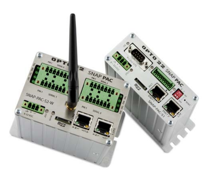
RFID technology can be used with PACs, PLCs, and I/O systems to improve manufacturing operations.

To move beyond asset management/inventory tracking/supply chain-type applications and fully prove its