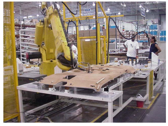
RFID tags attach to automobile parts coming down an assembly line. The tag is read by a transceiver, which communicates with IO systems and PLCs controlling a robotic arm.

which in turn communicate data to computers. What's missing? Answer: the direct link from the RFID system to the industrial device. There is great value in establishing this connection.